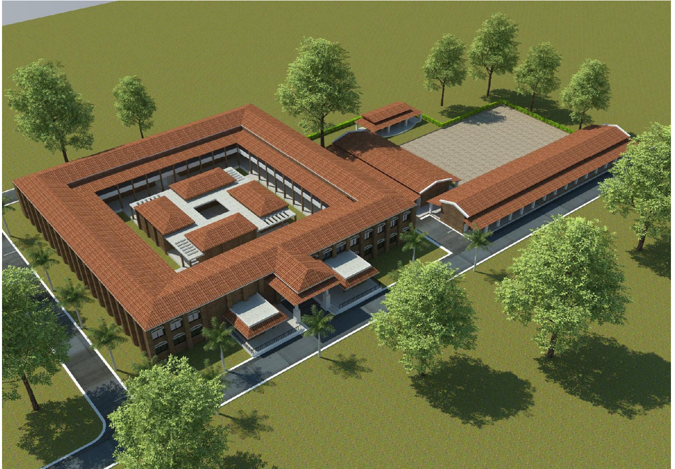
Main Building of Vidyā-Araṇyam

Vidyā-Araṇyam expands its educational services from June 2019 to Pre-Primary and Primary (class 1 to 8) in English & Marathi mediums.